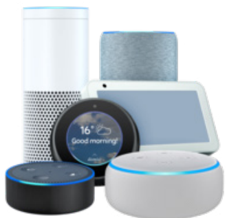
Smart home devices