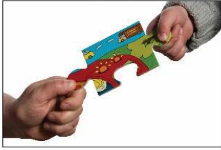
Supporting professionals working with parents with learning difficulties